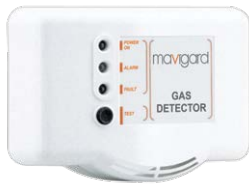
GD2R-220EC Mavigard Gas detector Carbon monoxide gas detector (CO), 220V DC, 2-level alarm output, electrochemical

Conventional carbon monoxide gas detectors are designed to detect gas leaks in enclosed spaces such as homes, garages, and similar areas. These gas detectors use electrochemical sensors, providing stable sensitivity and superior performance. They feature two-level alarm threshold values.